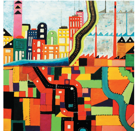
Land & Sk Acrylic on Canvas 39.5" x 39.5"

introduces a harmonious two-dimensional space that conveys the geometric and rational structure of the city and its quarters. Ciervo dubs this work “UrbanArchiPainting” and defines the idea as a reconstruction of a renewed urban landscape with its facades, its roofs, its squares and streets, districts where “colors become heat.” Born in 1953 in Moiano, Italy, initially trained and employed as an architect, Ciervo appropriates the architect’s idealized vision of the potential for a harmonious urbanity and employs it in a “two-dimensional system where the main part is devolved to structure, connectivity and juxtaposition of shapes and colors.” The third dimension arises from the pleasant sensations and imaginations in playful response to the gaze he proposes—as epicenters of culture, design, and diversity, the cities of Ciervo shine with optimism in the face of chaos.